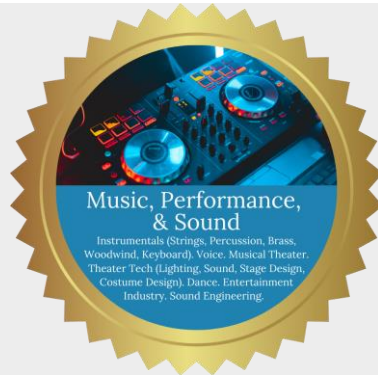
Music, Theater, & Sound