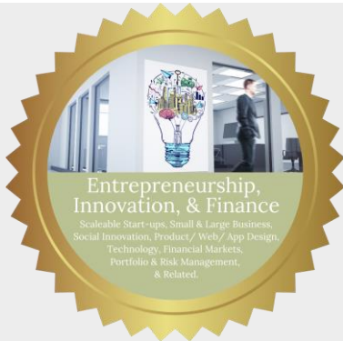
Entrepreneurship, Innovation, & Finance