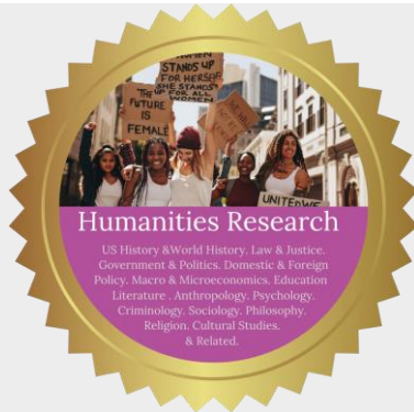
Humanities Research & Studies