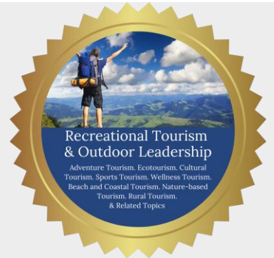
Recreational Tourism & Outdoor Leadership